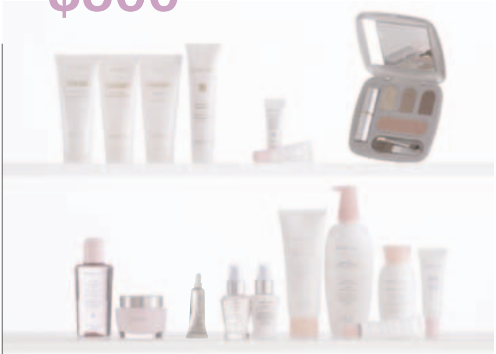
Products shown are a visual representation of an approximate product mix, volume and quantity.

To qualify, your order must be received in the same or following calendar month as your Independent Beauty Consultant Agreement.