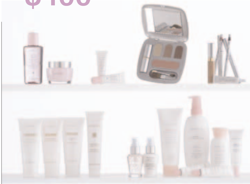
Products shown are a visual representation of an approximate product mix, volume and quantity.

To qualify, your order must be received in the same or following calendar month as your Independent Beauty Consultant Agreement.