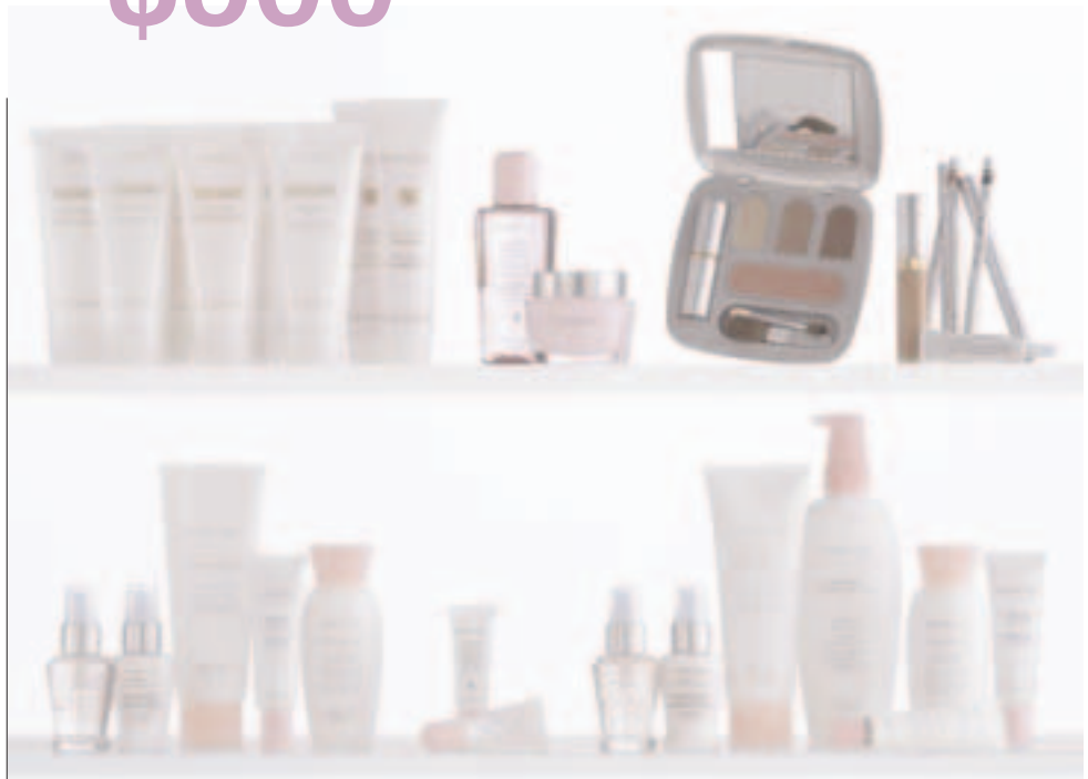
Products shown are a visual representation of an approximate product mix, volume and quantity.

To qualify, your order must be received in the same or following calendar month as your Independent Beauty Consultant Agreement.