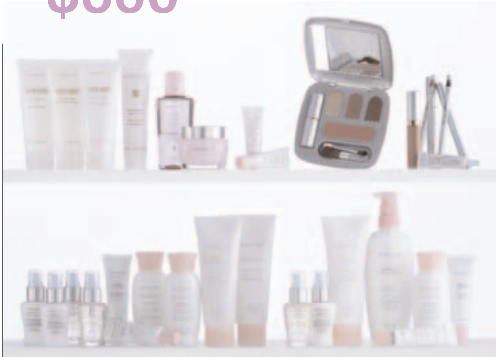
Products shown are a visual representation of an approximate product mix, volume and quantity.

To qualify, your order must be received in the same or following calendar month as your Independent Beauty Consultant Agreement.